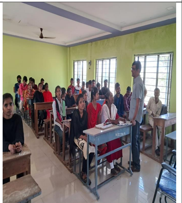
4. Career counselling on SWOC (18-07-2018)