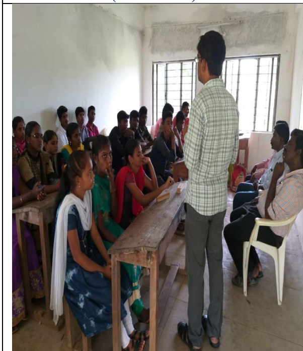
3. Coaching for PG Entrance test (03-03-2018)