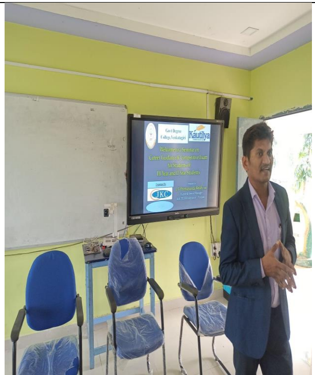
6. Conducted a Seminar on Career Guidance & Competitive Exam for the students (07-08-2019)