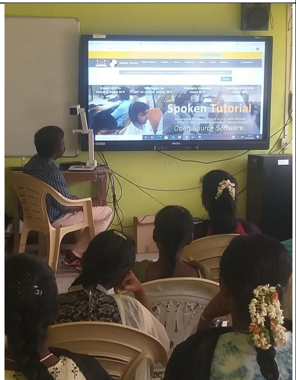
12. Awareness Programme on Spoken Tutorials (18-11-2022)