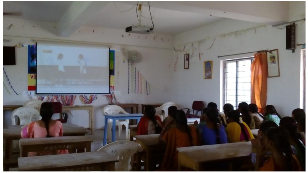
AWARENESS TO THE GIRL STUDENTS ABOUT SELF DEFENCE TECHNIQUES