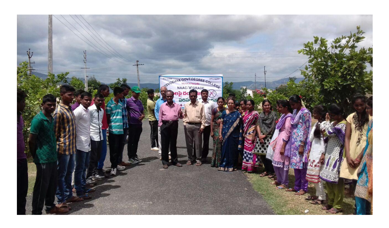
AWARENESS ON DOMALAPAI DANDA YATHRA (Anti- Mosquitoes) in slum areas