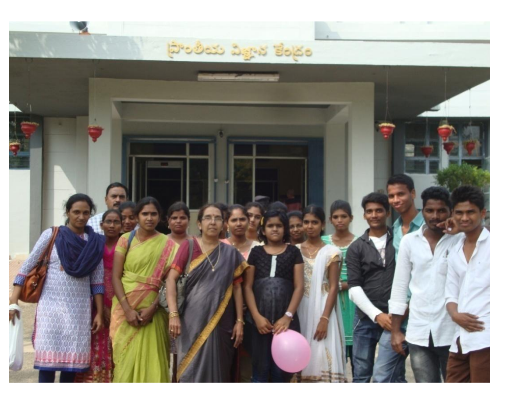
FIELD TRIP by B.Sc STUDENTS