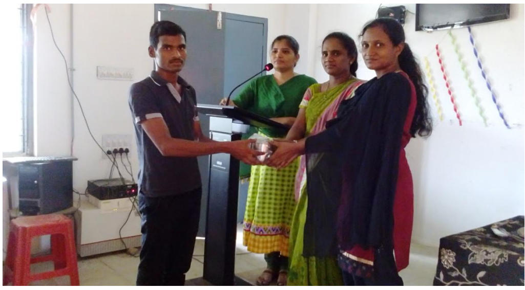
Activities conducted on the eve of Krishna Pushkaralu and prizes distributed to the winners in different competitions