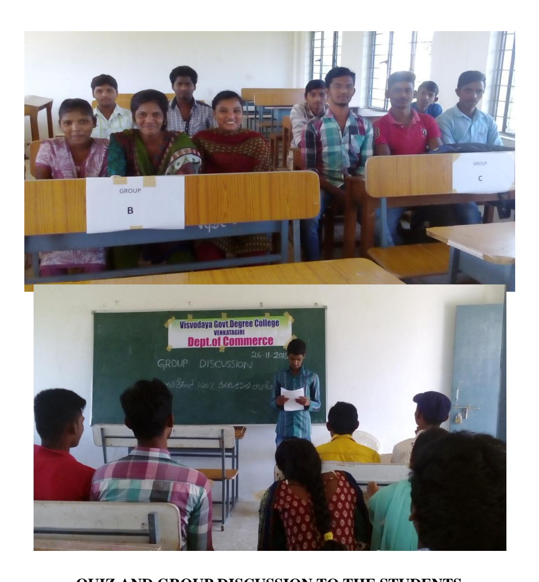
QUIZ AND GROUP DISCUSSION TO THE STUDENTS