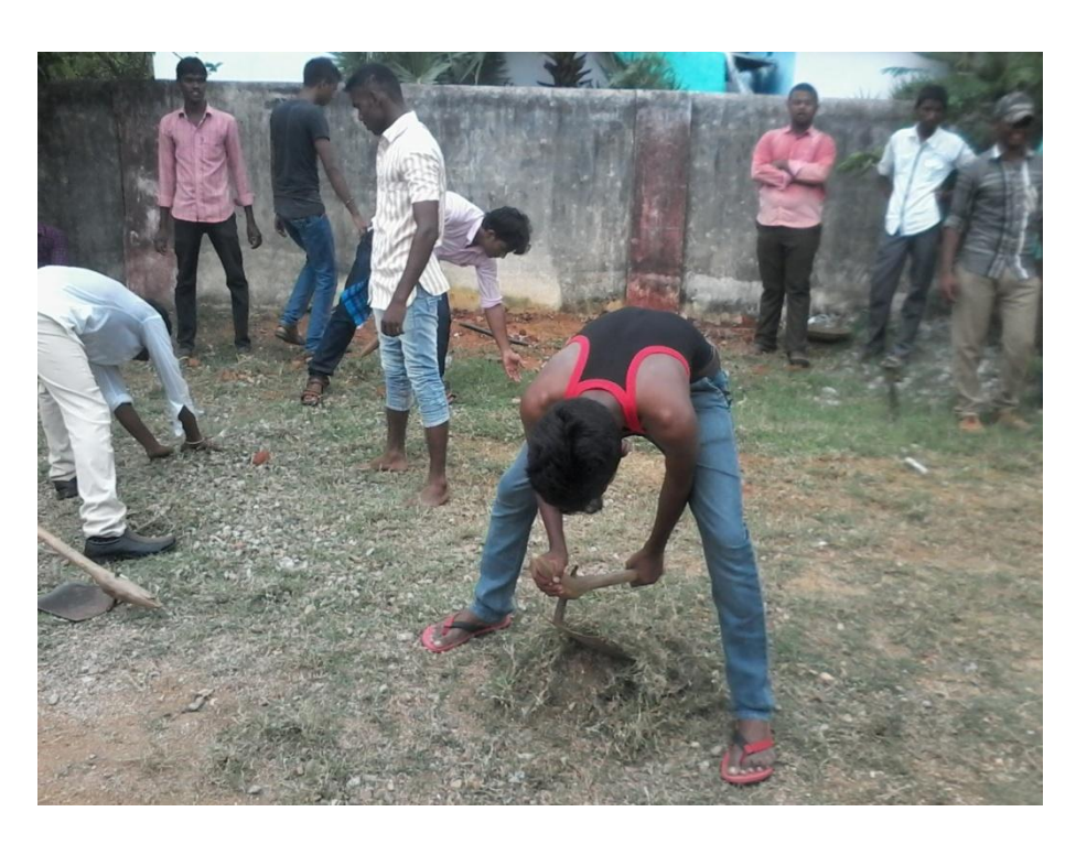
NSS SPECIAL CAMP ORGANISED IN JAGGARAJU PALLE VILLAGE