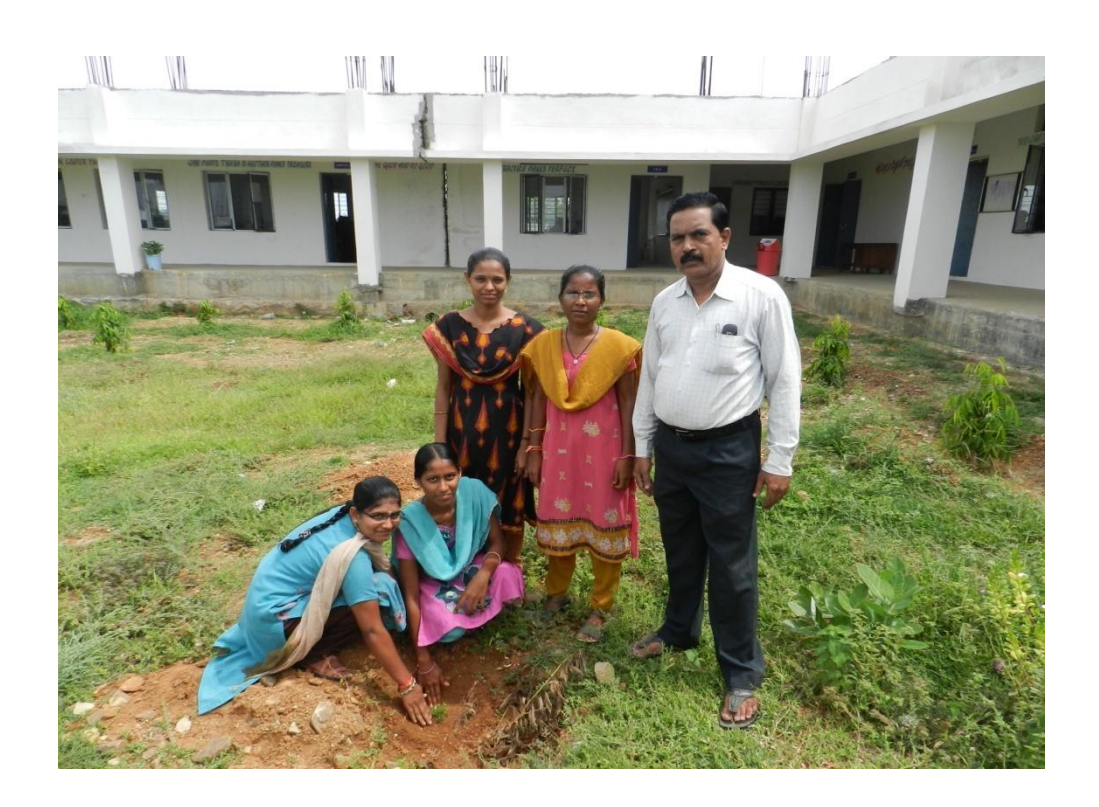
Medicinal Plants Plantation by Dept. of Botany