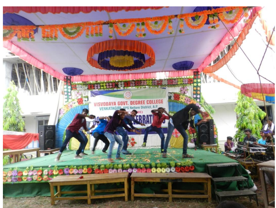
COLLEGE DAY CELEBRATIONS