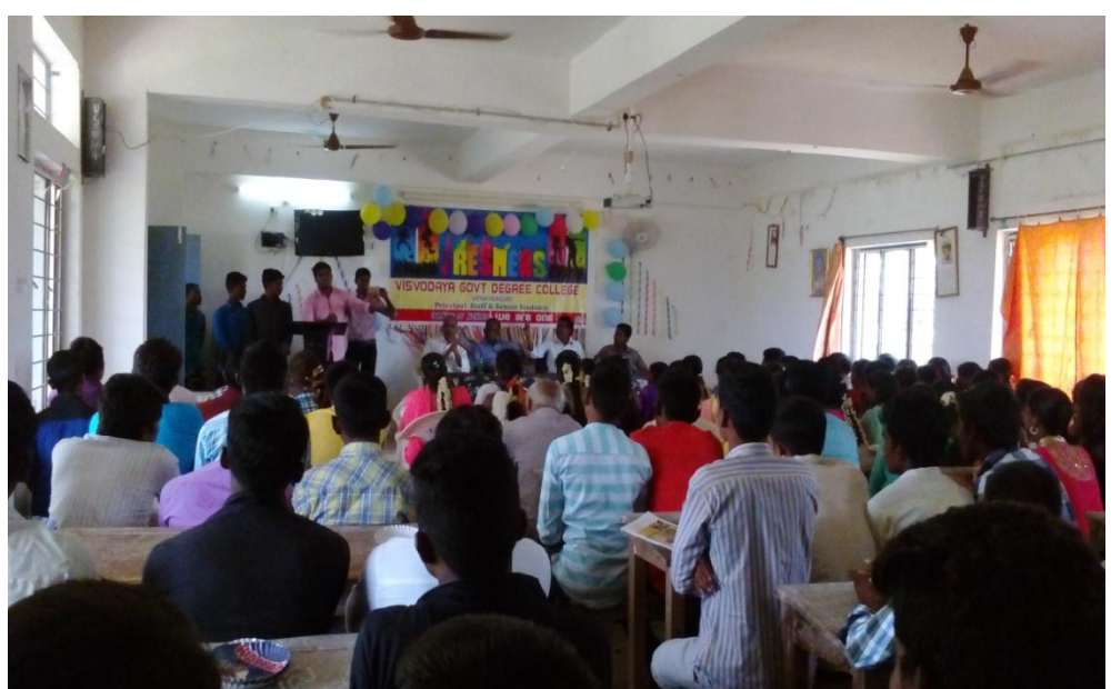
Freshers Day Celebrations in the College