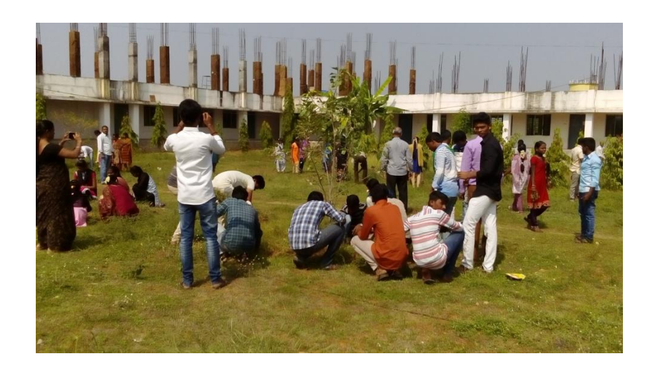
Swatch Bharat Programme in the college campus