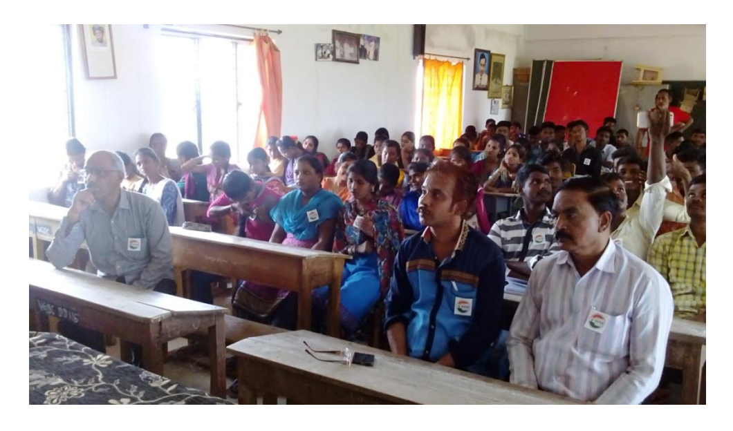
AWARENESS ON NATIONAL VOTERS DAY BY GOVT. OFFICIALS