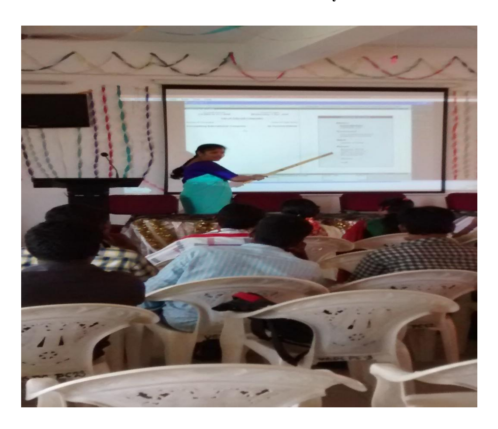
Youtube Lessons as part of ICT