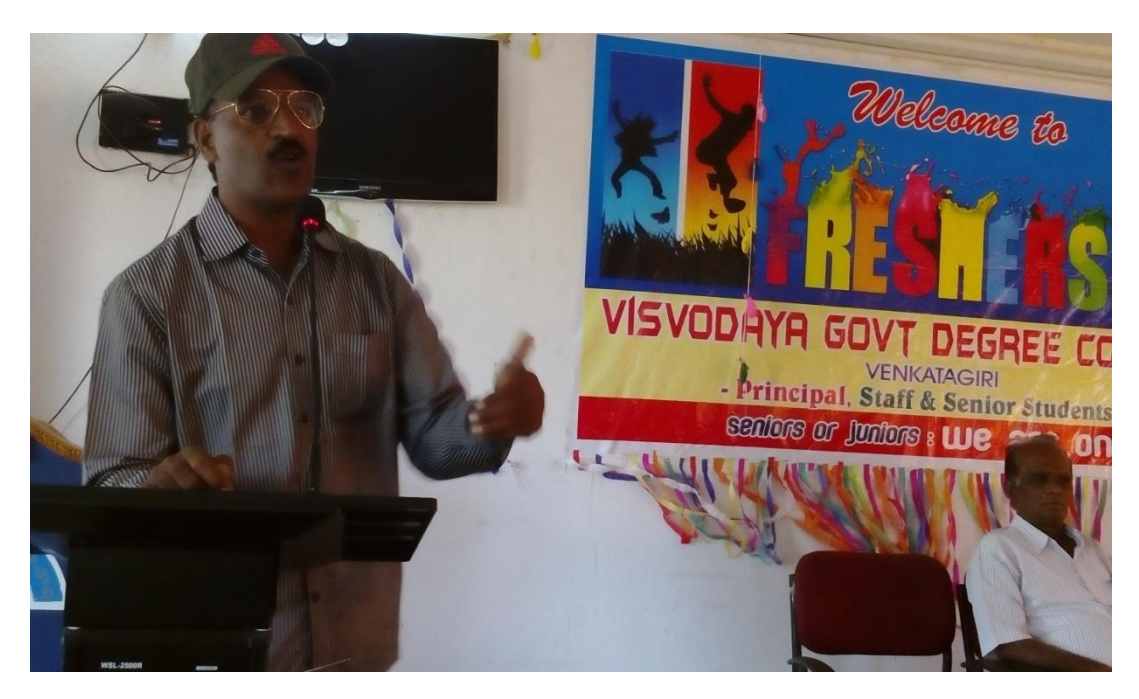
Awareness Programme on English Speaking Skills Was Organised on 7-9-2016