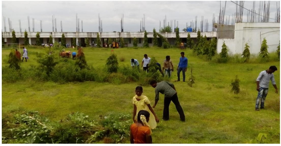
Clean and Green Programme in the College Premises