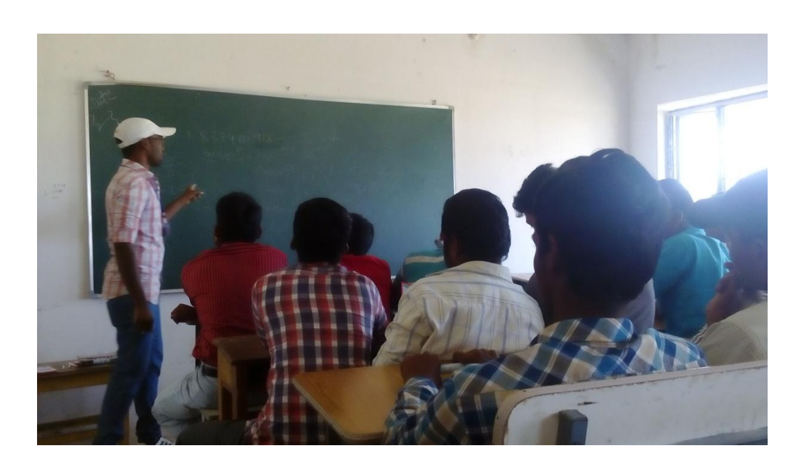
AWARENESS PROGRAMME ON DEFENCE JOBS TO THE STUDENTS