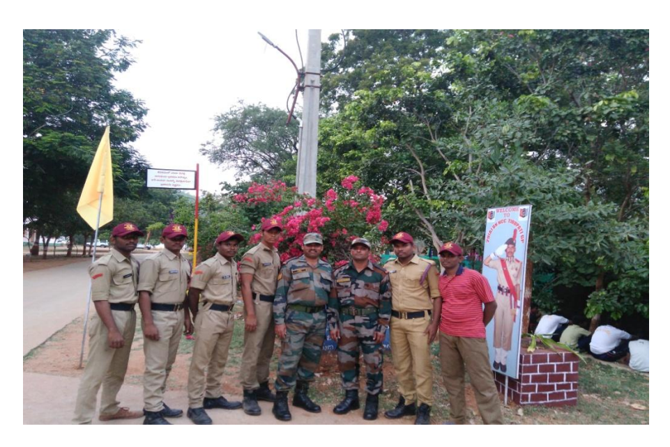
NCC College Unit cadets participated in AP Trecking Camp at Tirupati conducted by 29(A) BN NCC, Tirupati