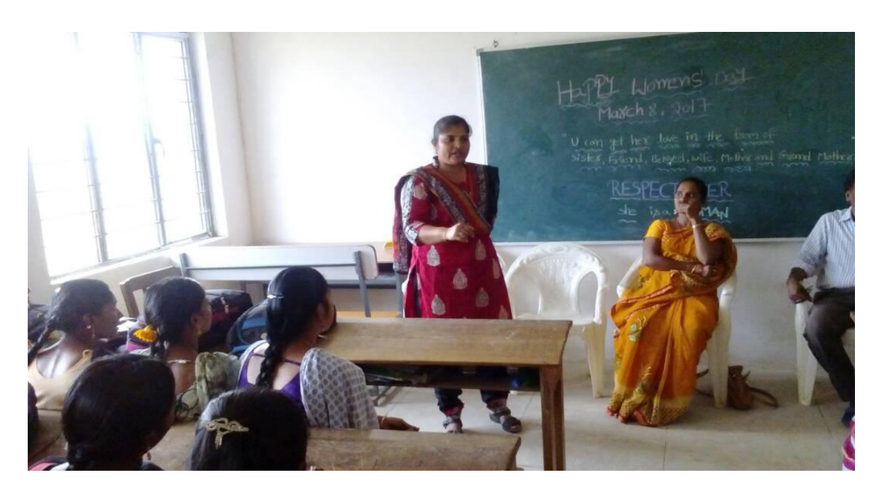
Celebrated "International Women's Day" on 8-3-2017