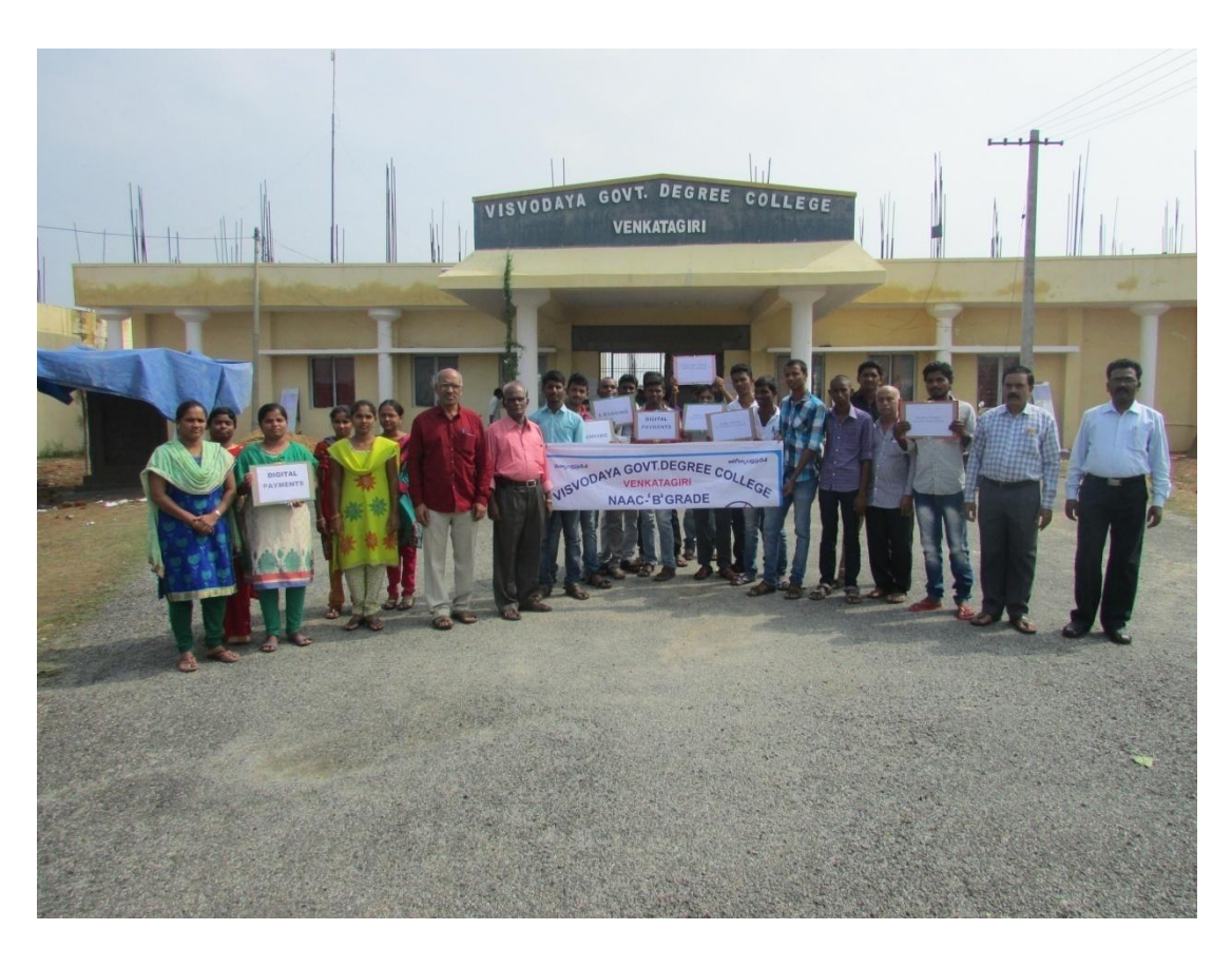
AWARENESS RALLY ON CASHLESS TRANSACTIONS BY THE COLLEGE STUDENTS AND STAFF