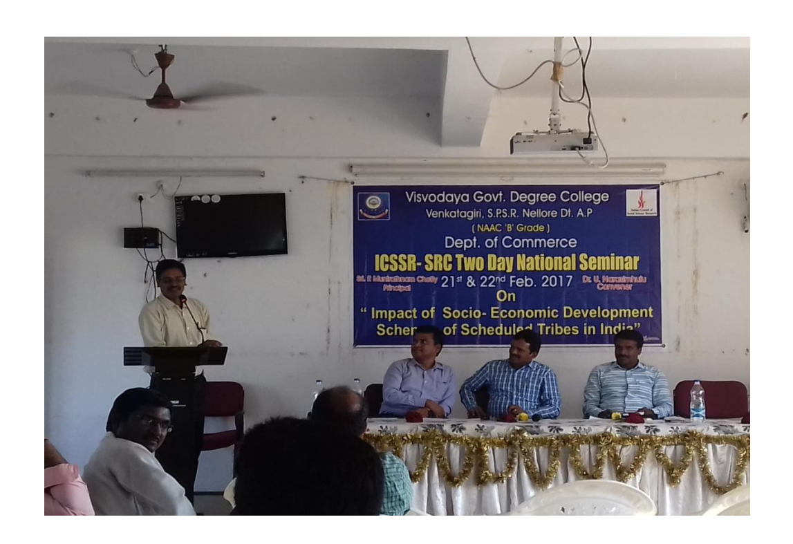
ICSSR SPONSORED TWO DAY NATIONAL LEVEL SEMINAR ORGANISED BY THE DEPARTMENT OF COMMERCE on "Impact of Socio – Economic Development Schemes of Scheduled Tribes in India" on 21^{ST} & 22^{ND} FEBRUARY 2017