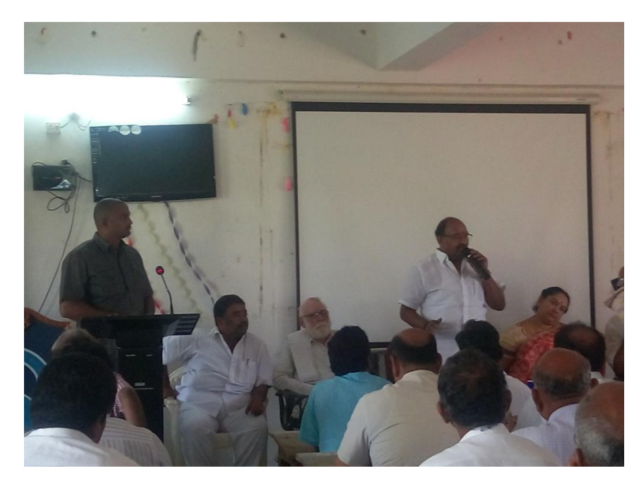
ALUMNI ASSOCIATION MEETING HELD AT COLLEGE PREMISES