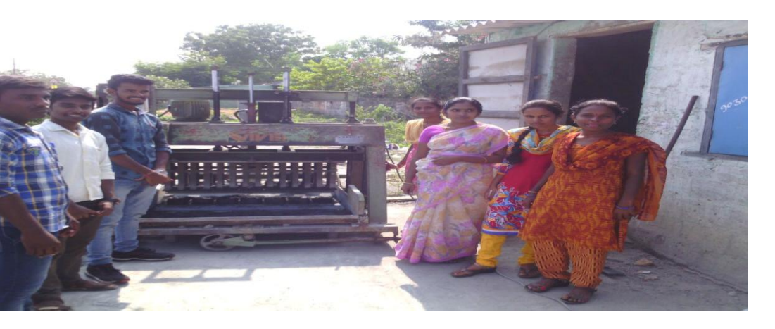
Dept. of Chemistry Field Trip